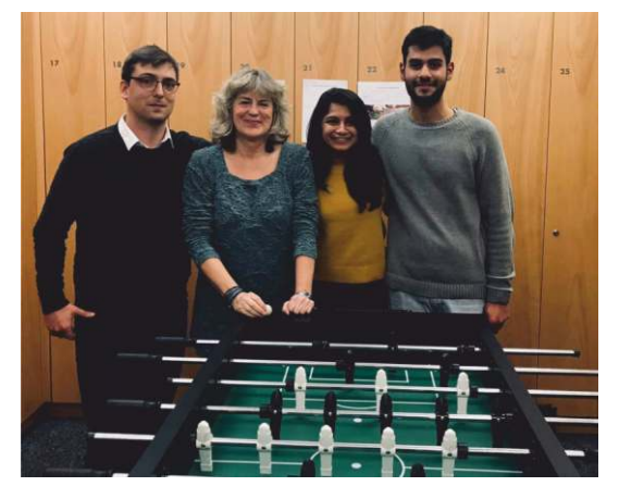
Table Football Tournament winning team

While we work hard at the WTI, sometimes we take a break! In 2018 the WTI launched the First Annual Table Football Tournament. Six teams of four people each competed, with teammates including students, professors, researchers and WTI staff. The competition involved a preliminary round, a semi-final round and final round.